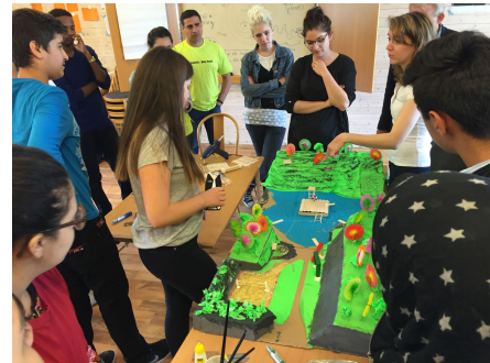
Figure 1: Visit to Entrepreneurship Camp

On monday morning we met again with the young students at the Entrepreneurship Camp in Lärjedalen. We helped them prepare for their presentations of development suggestions for the Bergsjön area (the lake). The young students then presented for Natur- och Parkförvaltningen, Göteborgs Stad and Bergsjön 2021 on tuesday 4th of July. It was inspiring for us to be able to help the young students and we are happy that they enjoyed having us around.